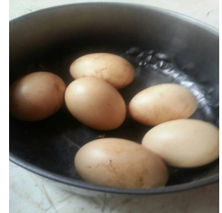
The chicken recipients are already enjoying their eggs