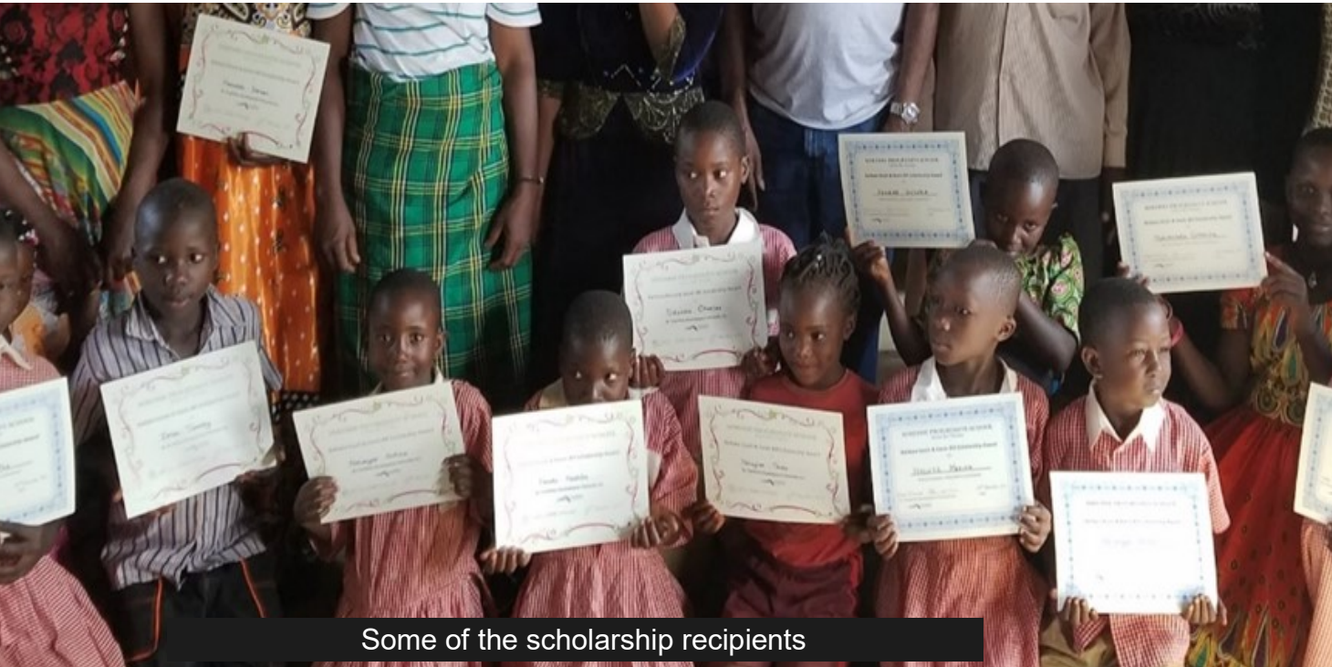
Some of the scholarship recipients

We make a difference One project at a time One family at a time One child at a time and One scholarship at a time