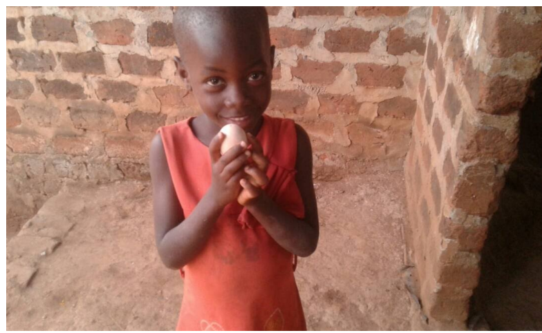
The faces say it all