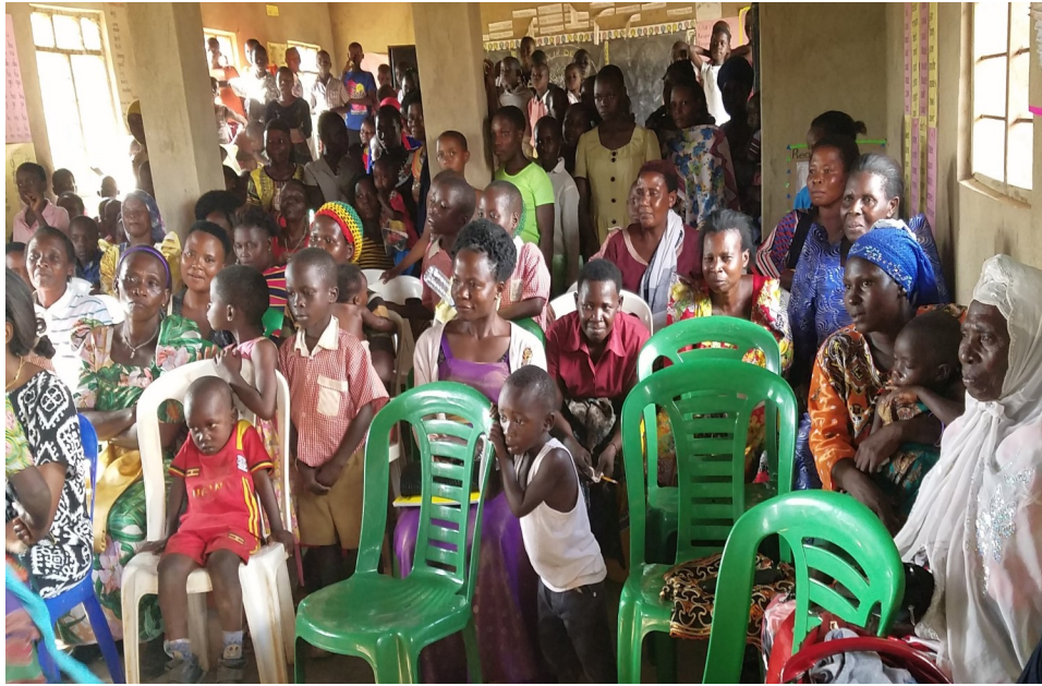
The award ceremony was well attended