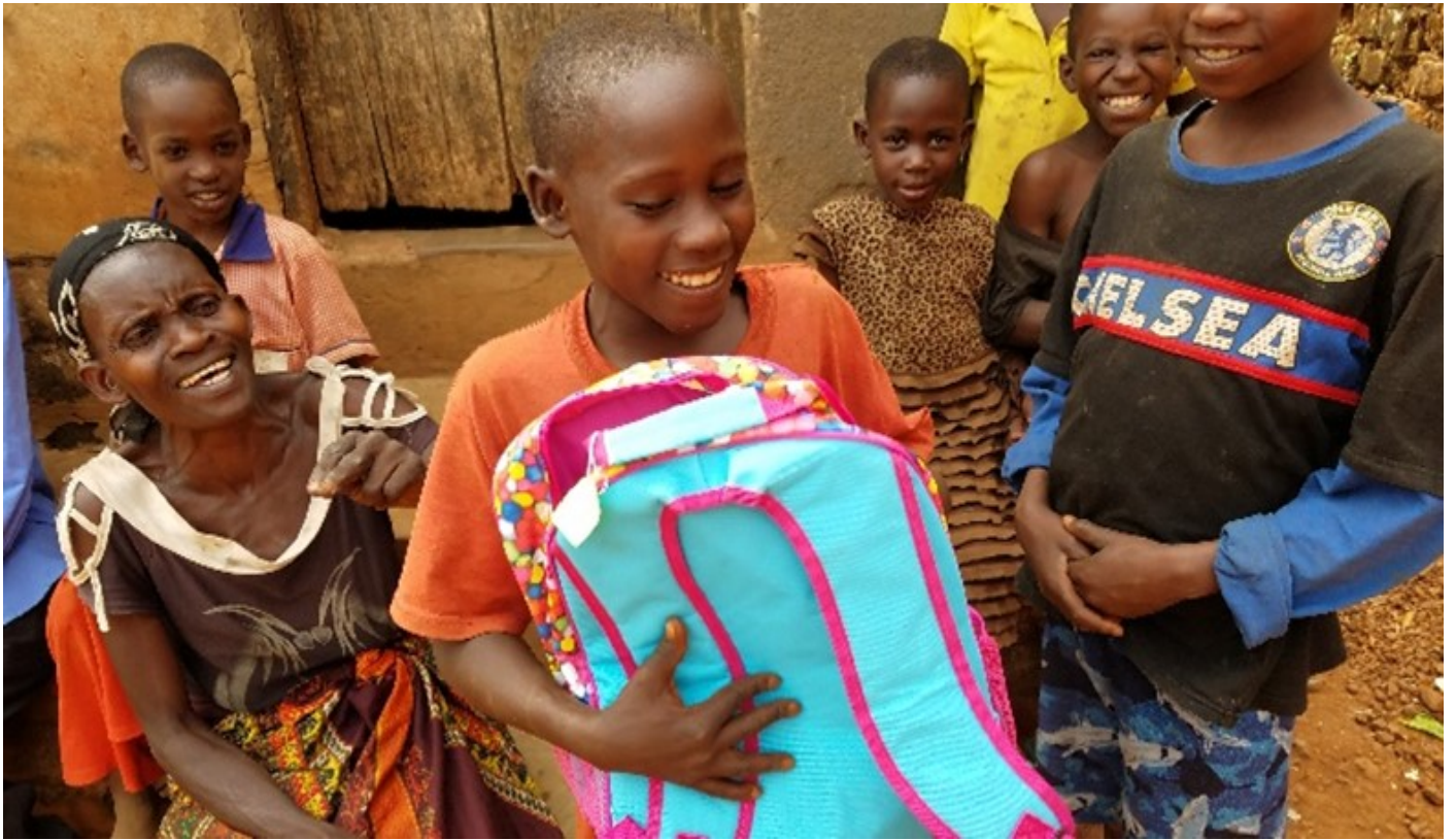
TOP: One very happy recipient of the backpack. BOTTOM: The school library

120 children received backpacks, pencils, notebooks, pens and T-shirts