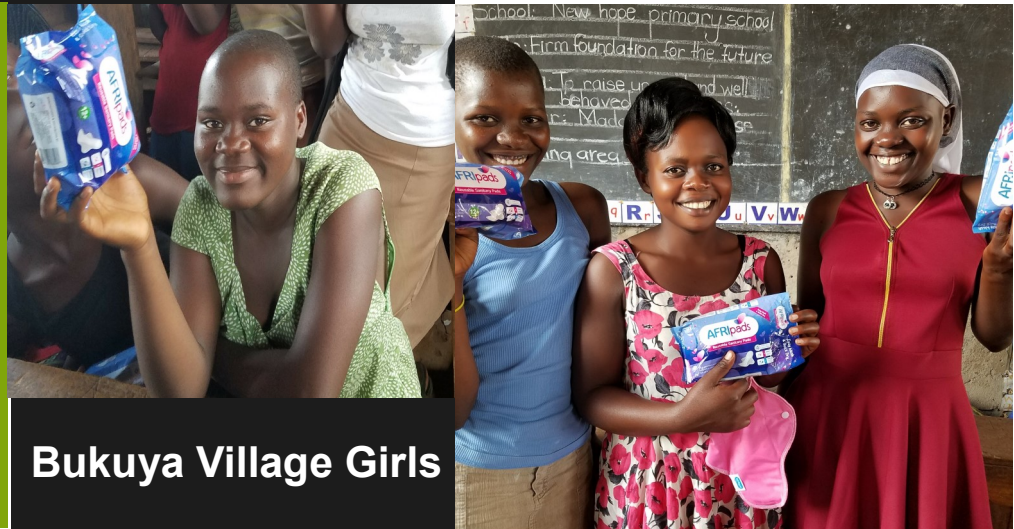
Bukuya Village Girls

One project at a time One family at a time One child at a time and One pad at a Time