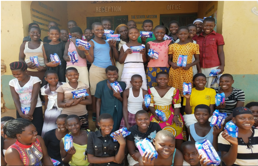
Bukuya Village re-usable sanitary pads recipients